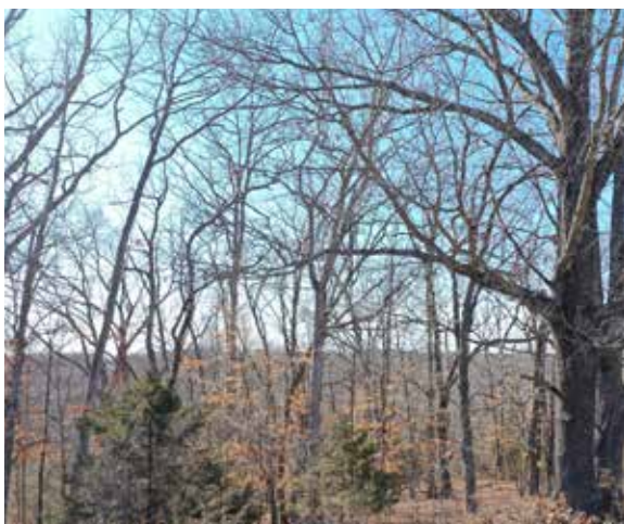
Lot 27 | $46K | 1.64 acres