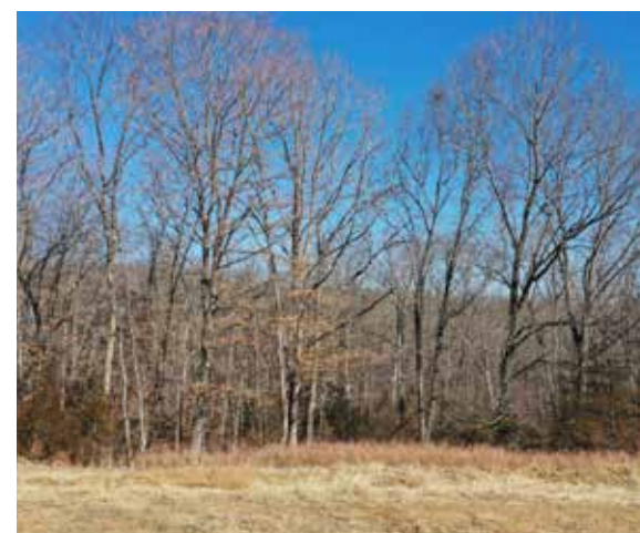
Lot 34 | $46K | 1.13 acres

CALL (573) 690-7268 TO SCHEDULE A SHOWING