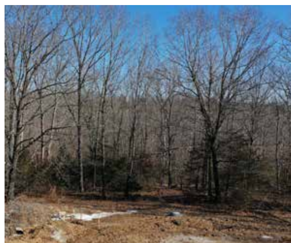
Lot 33 | $54K | 2.22 acres

Finally, we are the Best LOTS in the Sterling Ridge Development. This pristine development follows the contour of a wide ridge, allowing for large lots and paved streets + sidewalks in the county! Just 5 minutes from the MO River Bridge and (as the crow flies) on a close bluff to the Canterbury Winery, this development has the first phases of all custom homes that are immaculately kept. The yards are groomed & ready for a "Best Yard" competition, if there were one. Electric, water, & a subdivision treatment facility for waste water are all in place. There are mature trees making some lots very suitable for full walkout basements. There are also lots that would be ideal for larger slab homes if you are desiring to keep it all on one level. (Holts Summit)