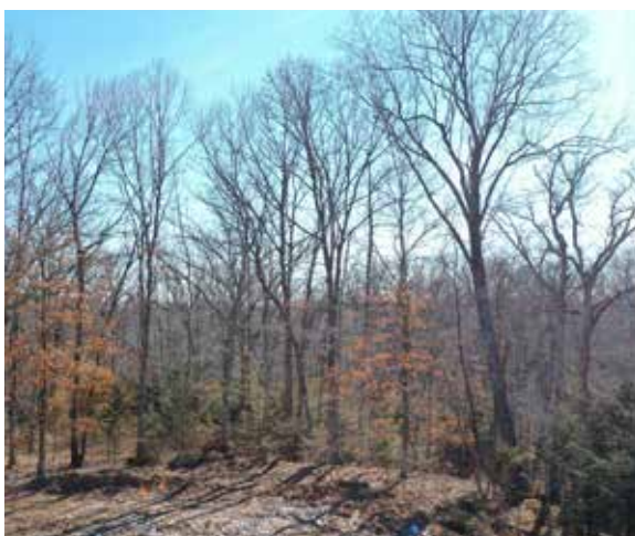
Lot 30 | $39.9K | .76 acres